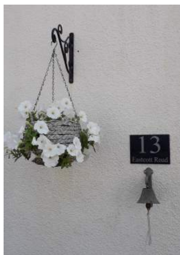
13 Eastcott Road