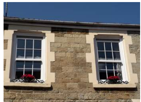
13 Prospect Place